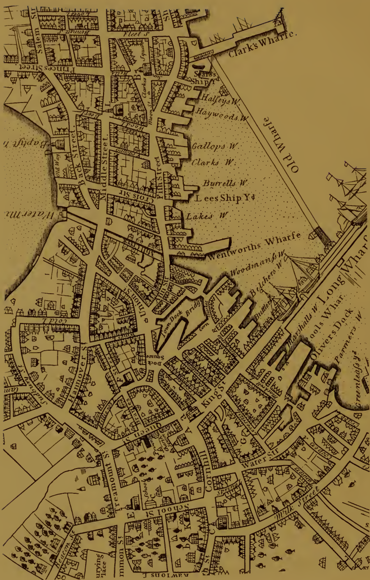
Plan of Boston's Business Section in 1722